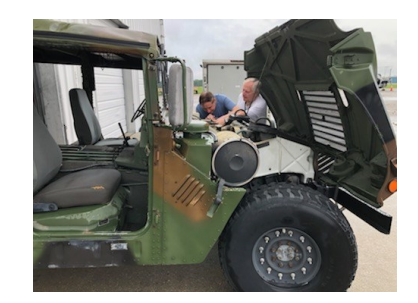
Servicing the HMMWV Drone Transporter