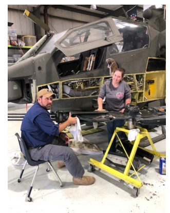
Completing Cobra Helicopter Maintenance