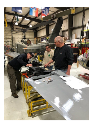
Mechanics inspecting rotor blades