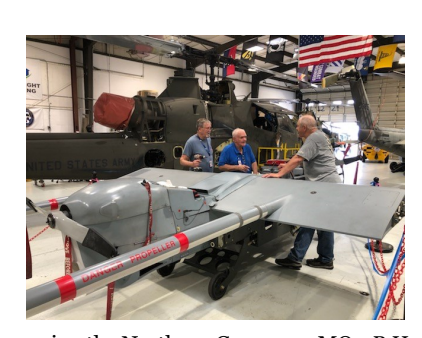
Preparing the Northrop Grumman MQ-5B Hunter Drone for it's first school visit