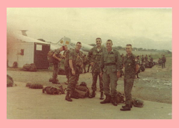
Special Forces Airborne jump, Viet Nam 1968