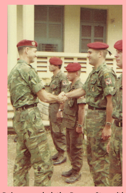
Being awarded the Bronze Star with Valor, Viet Nam 1968