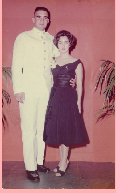
West Point Graduation Hop, 1960