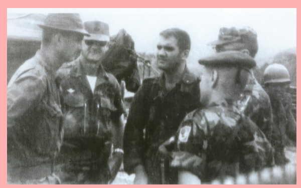
Briefing for Special Forces relief, Viet Nam 1967