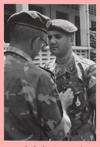
Being awarded the Bronze Star with Valor, Viet Nam 1968