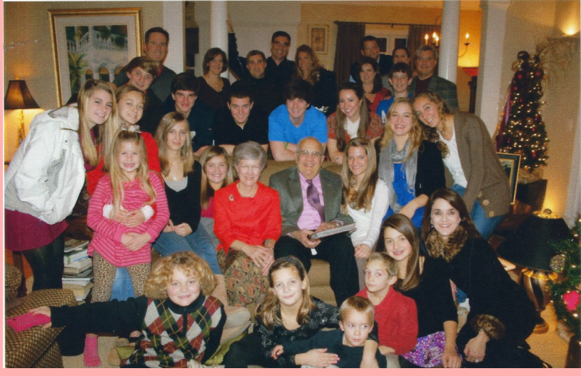
50th Wedding Anniversary with 19 Grandchildren, 2 sons and 3 daughters.