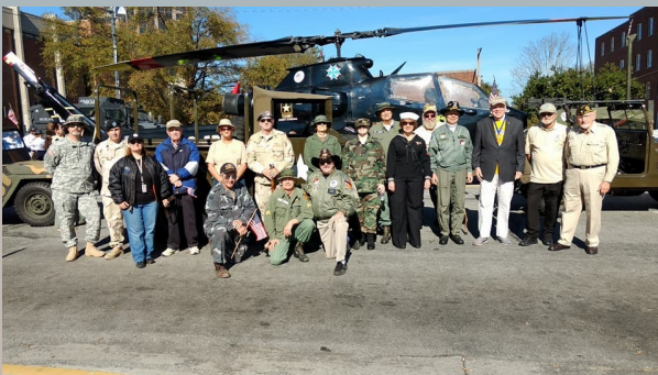
2017 Columbia Veterans Day Parade