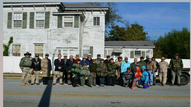
2017 Newberry Veterans Day Parade