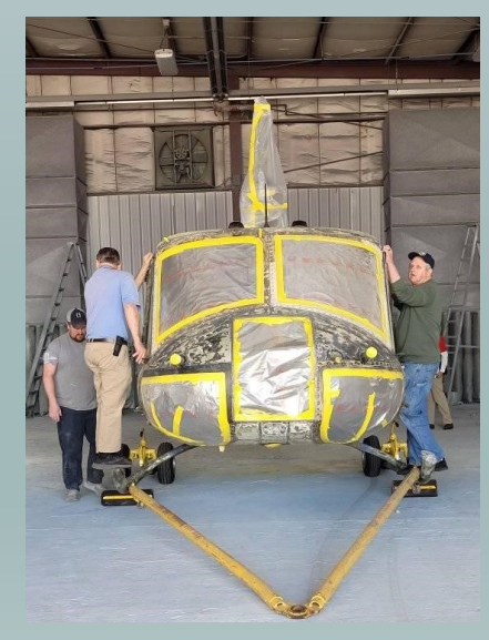
The final preparations