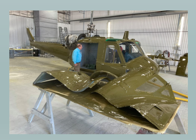
The finished product