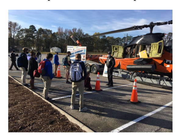
"CFF STEM visit to Brooklyn Casey High School as a proof of concept, following school Covid guidelines"

In December, 2020 the Foundation conducted several school visits under the watchful Covid restrictions and proved that our concept works.