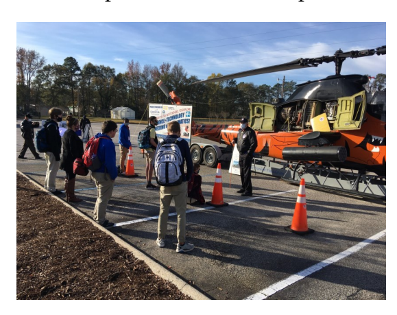
"CFF STEM visit to Brooklyn Casey High School as a proof of concept, following school Covid guidelines"

In December, 2020 the Foundation conducted several school visits under the watchful Covid restrictions and proved that our concept works.